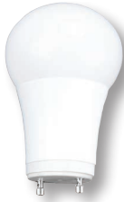
10W GU24 A19