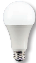
17/10/6 W A21 3 Way