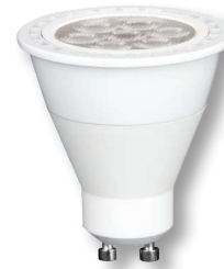
7W GU10 MR16