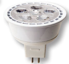
6.5W GU5.3 MR16