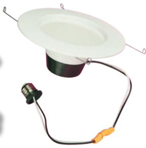
5" & 6" Downlights