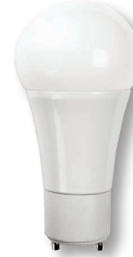
17.5W GU24 A21